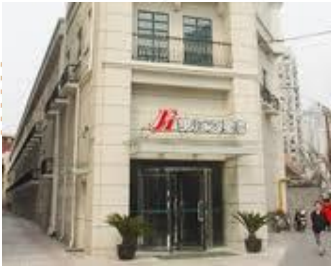
Jinjiang Inns Shanghai Zhongshan Park 锦江之星上海中山公园店