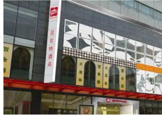
Pentahotel Shanghai 贝尔特酒店