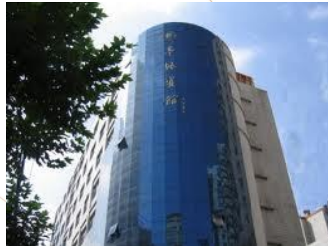
Ting-Feng Hotel 亭枫宾馆