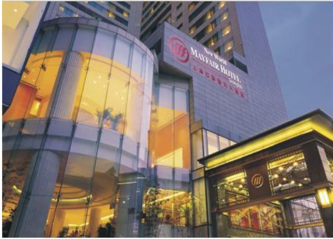
New World Mayfair Hotel 巴黎春天