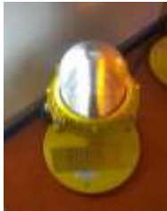
Fig.3 Ground side fire of the runway

long service life, high light quality with a color rendering index in the range of 80-95 and an optimal radiation pattern with the ability to create directional light.