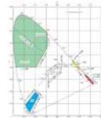
Fig.2 Colors of LED aerodrome light signals

But it is impossible to set the technical conditions for colors so as to completely eliminate the possibility of their misperception. For sufficiently reliable recognition, it is important that the illumination of the eye significantly exceeds the threshold of perception, that the color does not undergo significant changes due to selective (selective) atmospheric attenuation (absorption) and the color vision of the observer was normal. There is also a risk of distorted color perception in very bright light, which can be caused by a high-intensity light source at close range. Experience has shown that satisfactory recognition is possible when these parameters are given due attention.