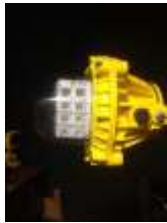
Fig.4 Ground bidirectional side fire of the runway

The design of the ground side runway light consists of two oppositely directed LED assemblies of eight LEDs mounted on a board complete with special optics to assemble and maximize light flux. Each module is represented by eight Cree LEDs (Fig. 4).