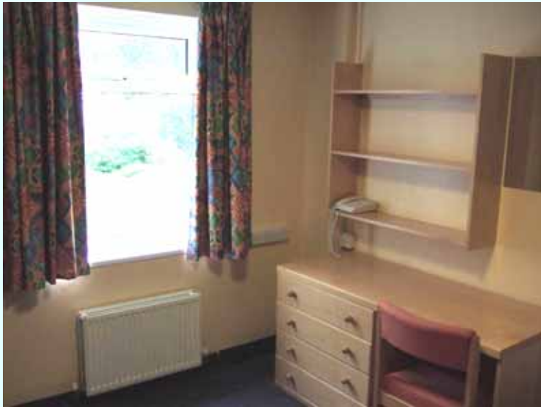
Typical room (with en suite facilities)